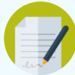
Unforeseen Illness, Injury or Death (including Coronavirus)

As the Coronavirus pandemic continues to disrupt life on a global scale, we've yet to understand what our "new normal" will be. What we do know, however, is that the virus could potentially impact people's holiday plans for some time to come.